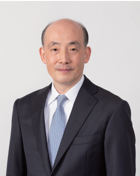
President, Kuraray Co., Ltd.

“Our Commitment” states the principles of our conduct which we should observe in doing our business. The “Kuraray Group Code of Conduct” serves as guidelines for us to adhere to while performing day-to-day work. We must fully understand its contents and inspire each other to raise our consciousness of these principles, all of us must comply with laws and regulations and “Our Commitment” under any circumstances. I, representing the Kuraray Group, declare as follows: